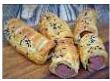
Smoked Beef Sausage Roll 6pcs@±75gr 48'500