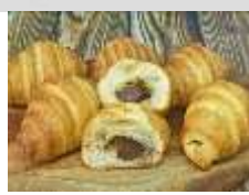
"Schoggi" Gipfel 6pcs@±35gr 49'000