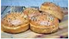
Brioche Burger Bun 6pcs@±90gr 45'500