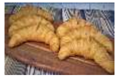
Buttergipfel 6pcs@±35gr 43'000