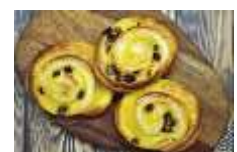
Raisin Vanilla Whirl 4pcs@±30gr 38'500