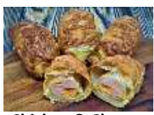
Chicken & Cheese Sausage Roll 6pcs@±75gr 48'500