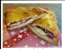
Swiss Chicken Cordon Blue Chicken Breast filled with Smoked Beef Ham and Swiss Chees ±170gr 42'500