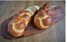
Butter Zopf ±350gr 32'000