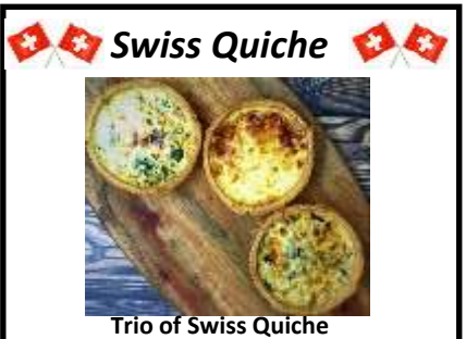
Trio of Swiss Quiche 93'000