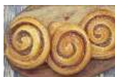
Cinnamon Whirl 4pcs@±30gr 38'500