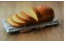
Brioche ±350gr 34'500