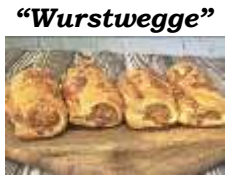
"Wurstwegge" Home made Chicken Meat and Cheese filling 4pcs@±100gr 63'500