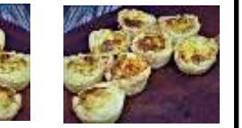
Mini Mushroom Quiche 8pcs@±30gr 45'500