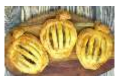
Apple Puff 4pcs@±30gr 60'000