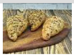
Volkorn Gipfel 6pcs@±40gr 43'500