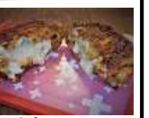
Triple C Burger Chicken Meat with Chili and stuffed with Cheese ±200gr 37'000