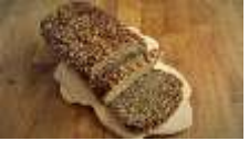
Nordländer ±850gr 68'000