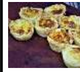
Swiss Cheese Quiche 4pcs@±120gr 148'000