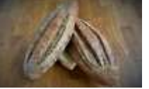
Winzer Bread ±460gr 49'000