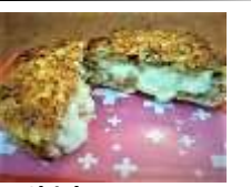
Chicken Burger Ticino Chicken Meat with herbs and stuffed with a Cheese ±200gr 37'000