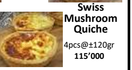
Swiss Mushroom Quiche 4pcs@±120gr 115'000