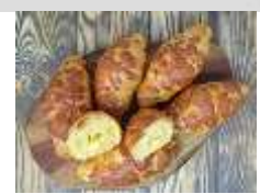
Swiss Cheese Gipfel 6pcs@±30gr 72'000