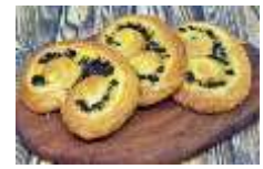
Chocolate Palmier 4pcs@±30gr 38'500