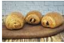
Chocolate Croissant 4pcs@±50gr 46'000