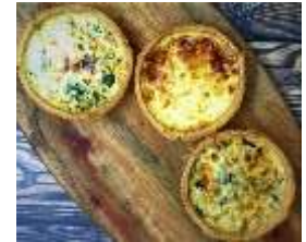
Trio of Swiss Quiche 79'500