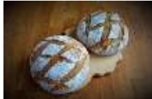
Farmer Bread ±350gr 20'900