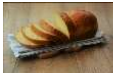
Brioche ±350gr 30'000