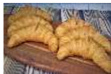
Buttergipfel 6pcs@±35gr 37'400