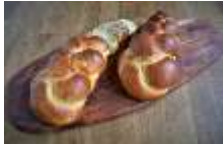
Butter Zopf ±850gr 27'500