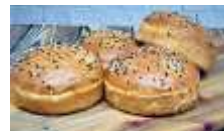
Brioche Burger Bun 6pcs@±90gr 39'600