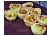
Mini Mushroom Quiche 8pcs@±30gr 39'600