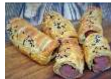
Smoked Beef Sausage Roll 6pcs@±75gr 35'700