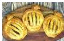
Apple Puff 4pcs@±30gr 50'000