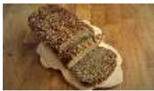
Nordländer ±850gr 54'500