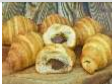
"Schoggi" Gipfel 6pcs@±35gr 43'000