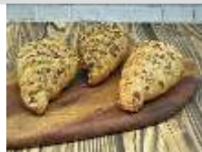
Volkorn Gipfel 6pcs@±40gr 30'000