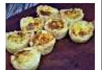
Mini Smoked Beef Quiche 8pcs@±30gr 39'600

Every Saturday Fresh Baked Bread Loafs Order Jakarta 0811 144 2790 Order Sentul 0818 69 04 29