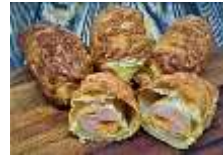
Chicken & Cheese Sausage Roll 6pcs@±75gr 35'700