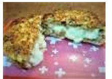
Chicken Burger Ticino Chicken Meat with herbs and stuffed with a Cheese ±200gr 31'500