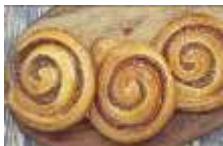
Cinnamon Whirl 4pcs@±30gr 33'500