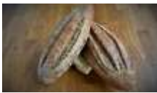
Winzer Bread ±460gr 43'500