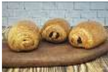
Chocolate Croissant 4pcs@±50gr 40'000