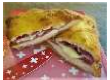
Swiss Chicken Cordon Blue Chicken Breast filled with Smoked Beef Ham and Swiss Chees ±170gr 36'900