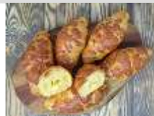
Swiss Cheese Gipfel 6pcs@±30gr 69'000