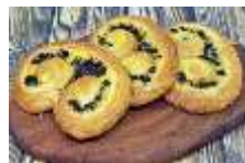
Chocolate Palmier 4pcs@±30gr 33'500