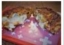
Triple C Burger Chicken Meat with Chili and stuffed with Cheese ±200gr 31'500