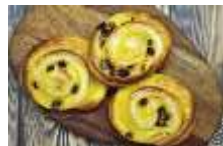
Raisin Vanilla Whirl 4pcs@±30gr 33'500