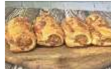
Chicken Meat Puff Home made Chicken Meat and Cheese filling 4pcs@±100gr 56'000